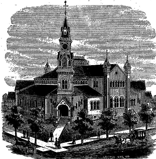
BATTLE CREEK TABERNACLE.

At the General Conference of 1883, it was decided to establish a paper in England. The office was first located at Great Grimsby, and shortly thereafter commenced the publishing of the Present Truth , a sixteen-page monthly. It was afterward changed to an eight-page semi-monthly, and is now a sixteen-page semi-monthly. A few months since the office of publication was removed to London, and the publishing work is now carried on