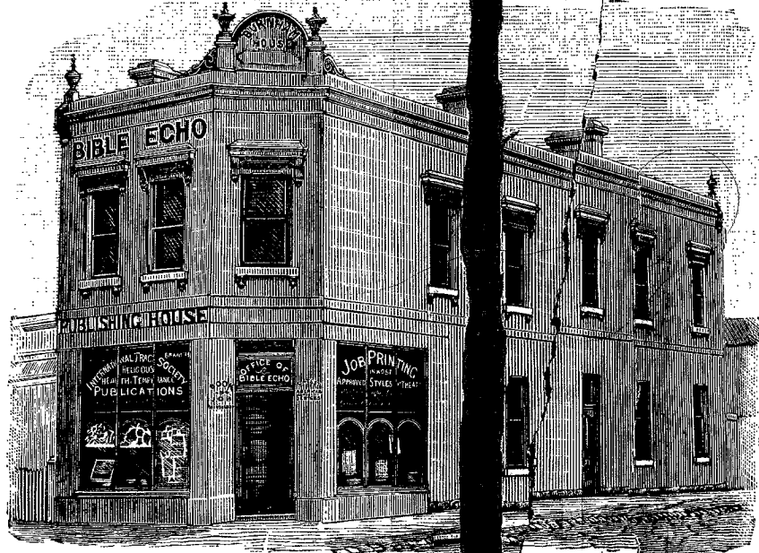
ECHO PUBLISHING HOUSE.

All seemed in better health on their arrival in this new field of labor than on leaving their native shore. All were in good spirits. They felt that God was with them, and would bless them in opening up this new field, and therefore entered upon their work in great courage.