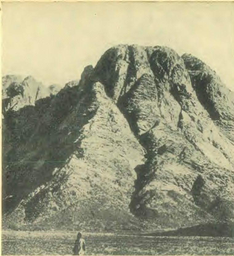
Mt. Sinai where Moses received the Decalogue.

M ANY things which were once regarded as right and proper are now out of date; for instance, certain types of clothes, certain kinds of transport, certain sorts of houses. How often does one see a silk hat nowadays, except on very special occasions? or a hansom cab? or a dwelling such as our Saxon fathers occupied in the days of William the Conqueror?