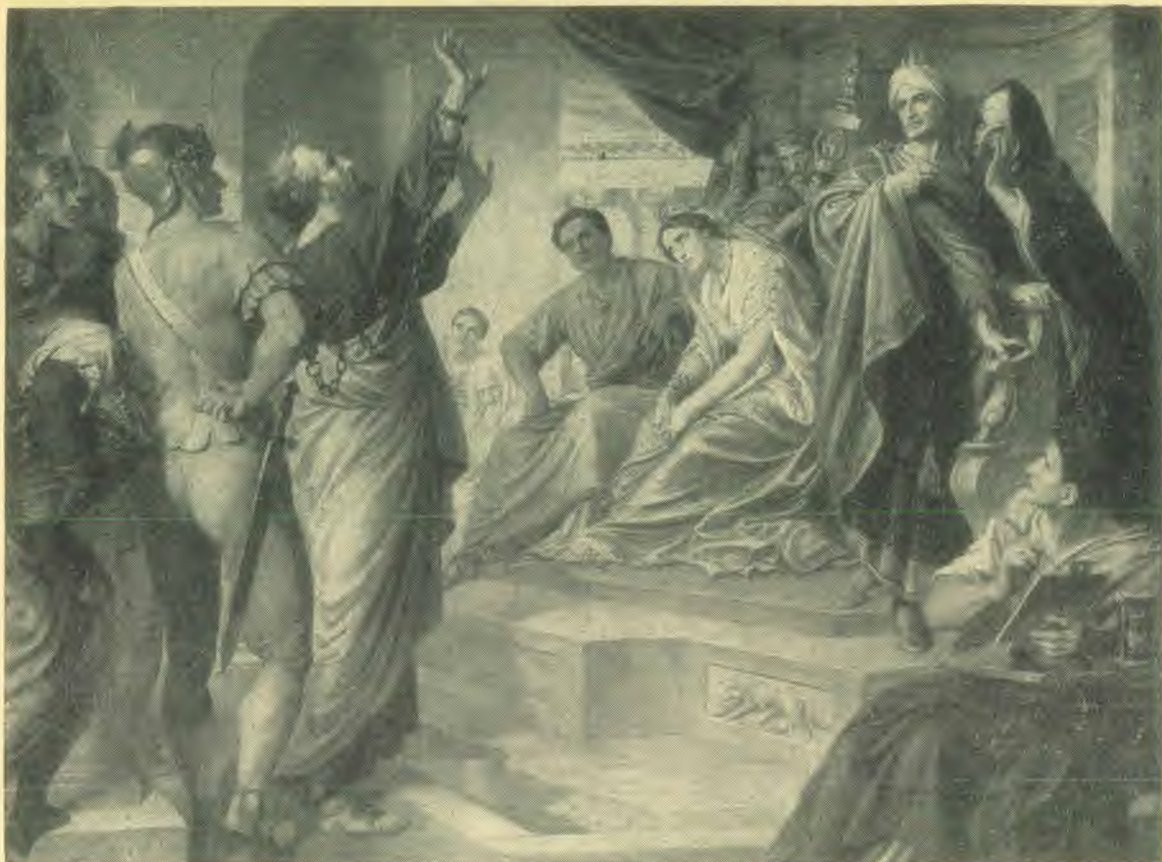
By F. Shields