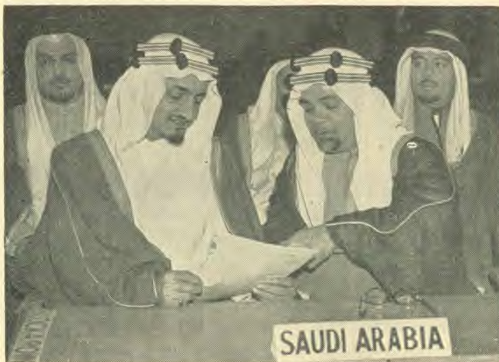
Saudi Arabian delegates at a meeting of the United Nations.