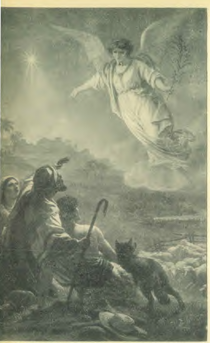
By B. Plockhurst "This day . . . is born a Saviour."

ALMOST every mechanical magazine we pick up tells us of inventions that are unfathomable to the average mind. This is an age of inventive mysteries. Many people use and operate such modern inventions as the motor car, the aeroplane, the telephone, and television without understanding the principles of their operation. Even electricity, which has become the servant of so many, remains a deep, dark mystery.