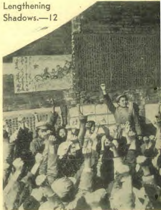
A Communist leader stirs the populace of a Ch... from Wes...

coming of the "time of the end," however, saw the beginning of a momentous new development in the relations between East and West.