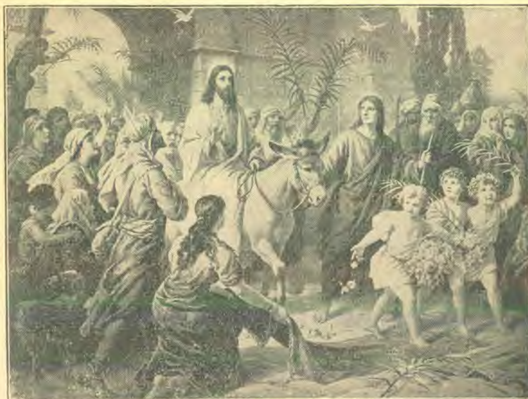
By B. Plockhorst

Of course he did not agree with me that he was limiting God. We spent two hours that evening reasoning, talking, arguing. Finally our conversation came around to prophecy. I mentioned some of the prophecies concerning