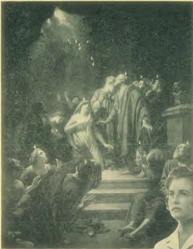
By A. Van der Werff