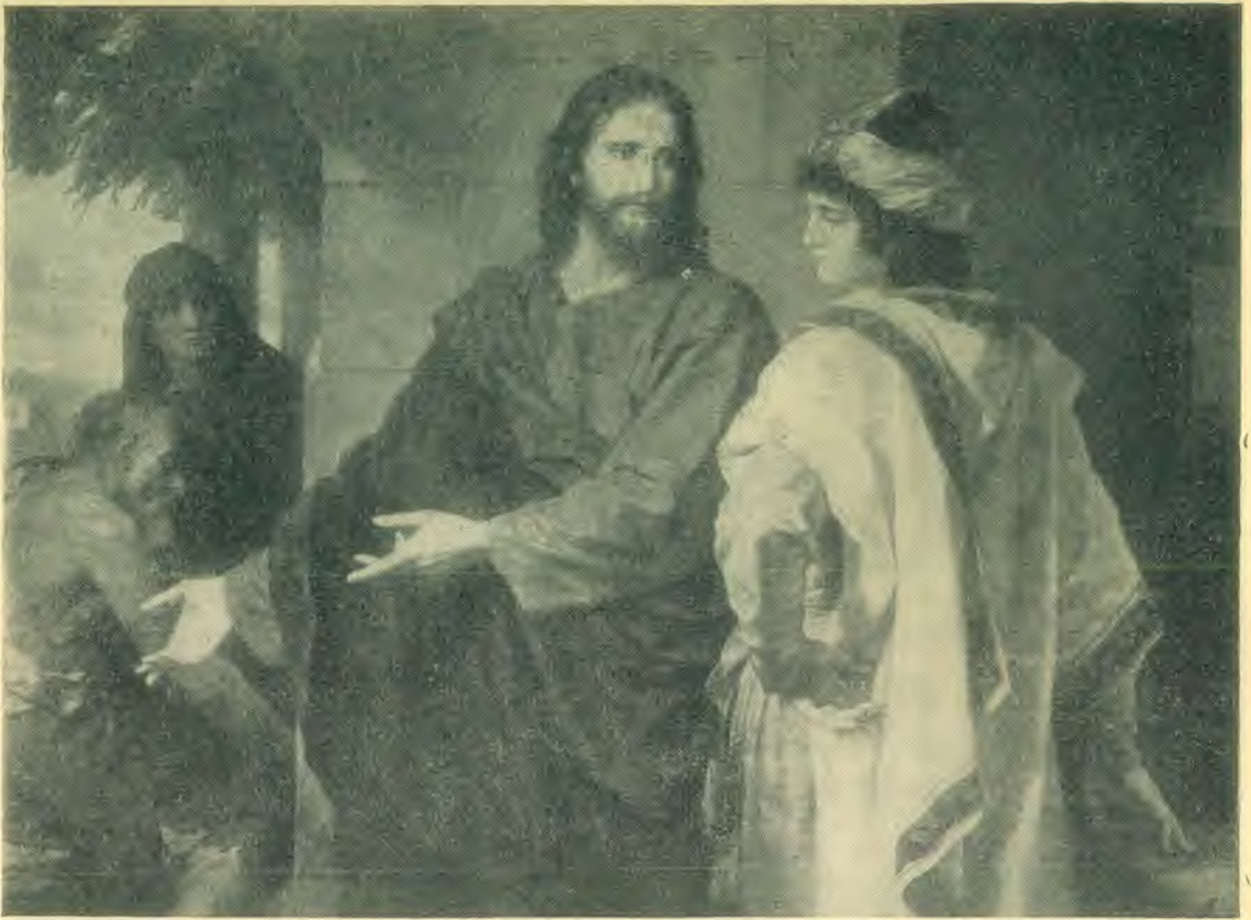
"One thing thou lackest," said Jesus to the rich young ruler.