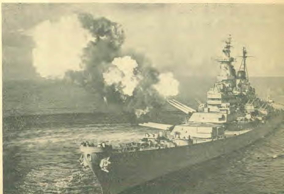
The U.S battleship "Missouri" in action off the coast of Korea.