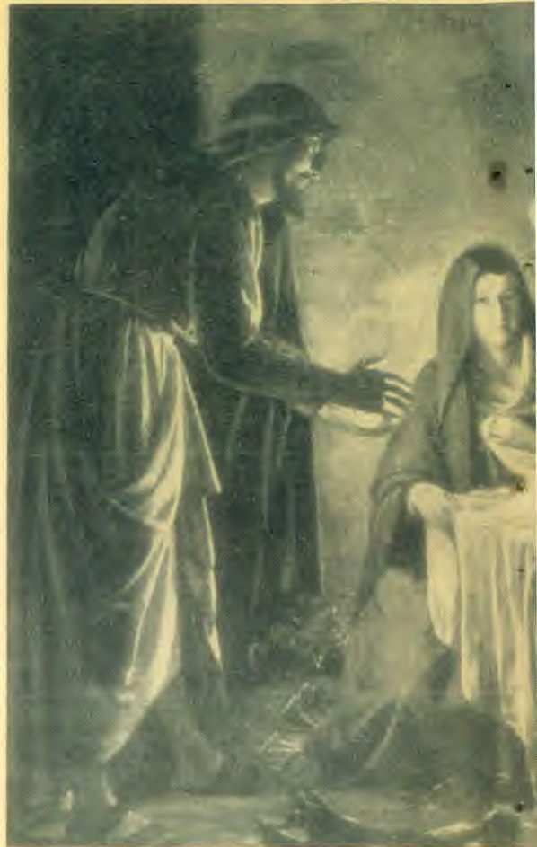
By Carl Bloch

"Because, sir, only to-night, not far from here, the whole countryside was lit with a wondrous light, the very glory of the Lord. And we saw the angel of the Lord, and he said to us, 'Unto you is born this day in the