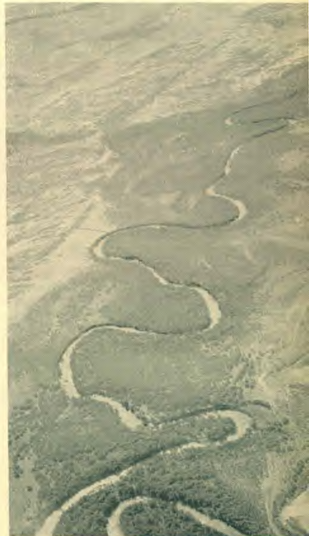
The tortuous path of the River Jordan through the "jungle" of the lower valley.

That story, based upon facts familiar enough to the Jews of Christ's day, must have been re-enacted on countless subsequent occasions on the old road through the "wilderness," and there was just a little perturbation in my own mind as I remembered that a missionary acquaint-