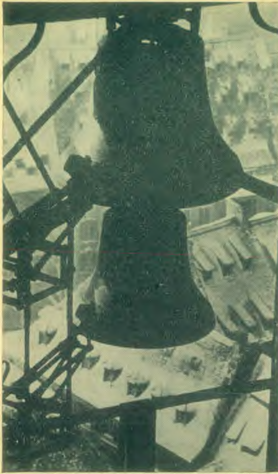
© Keystone "Ring out the Old; ring in the New."

As another New Year's day dawns upon our troubled world, millions stand gazing into the future, wondering what it holds in store for them of joy or sorrow.