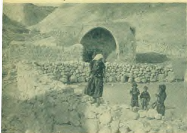
Above.—The Apostles' Fountain on the Jericho Road.