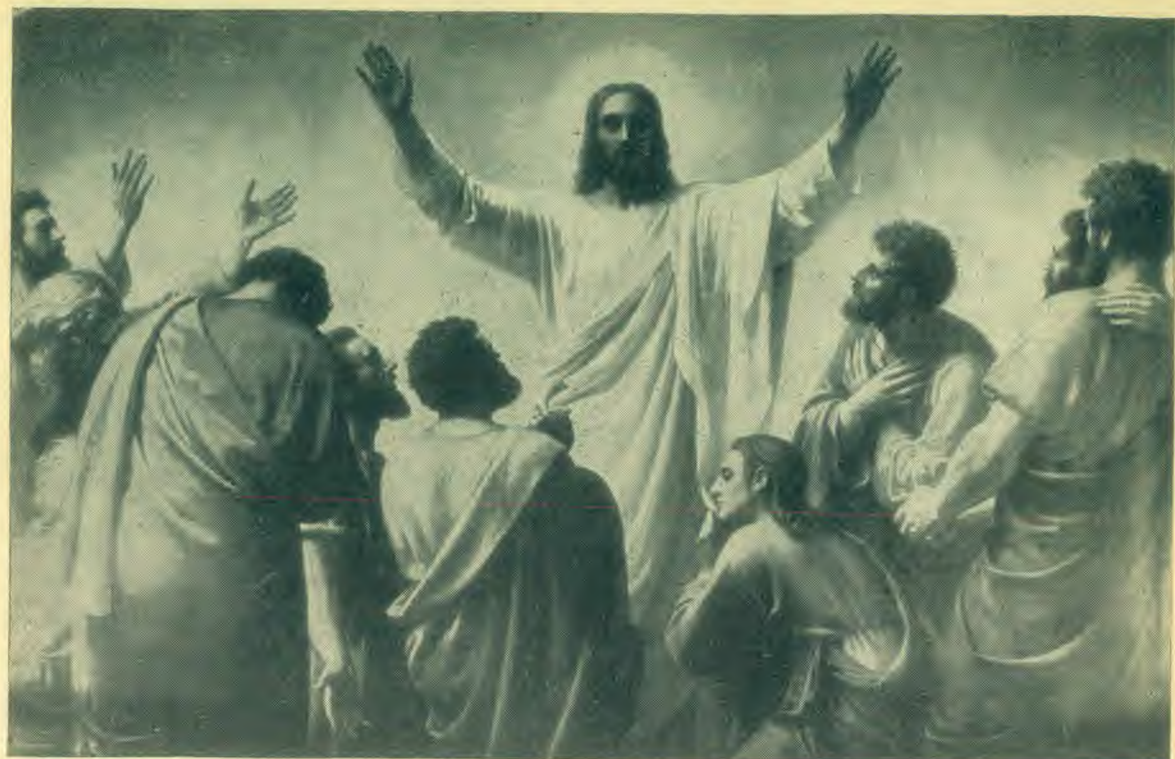
"Come Unto Me."