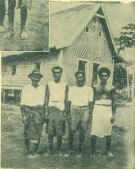
From torrid lands to the icy north the true people of God are obedient to the divine command.