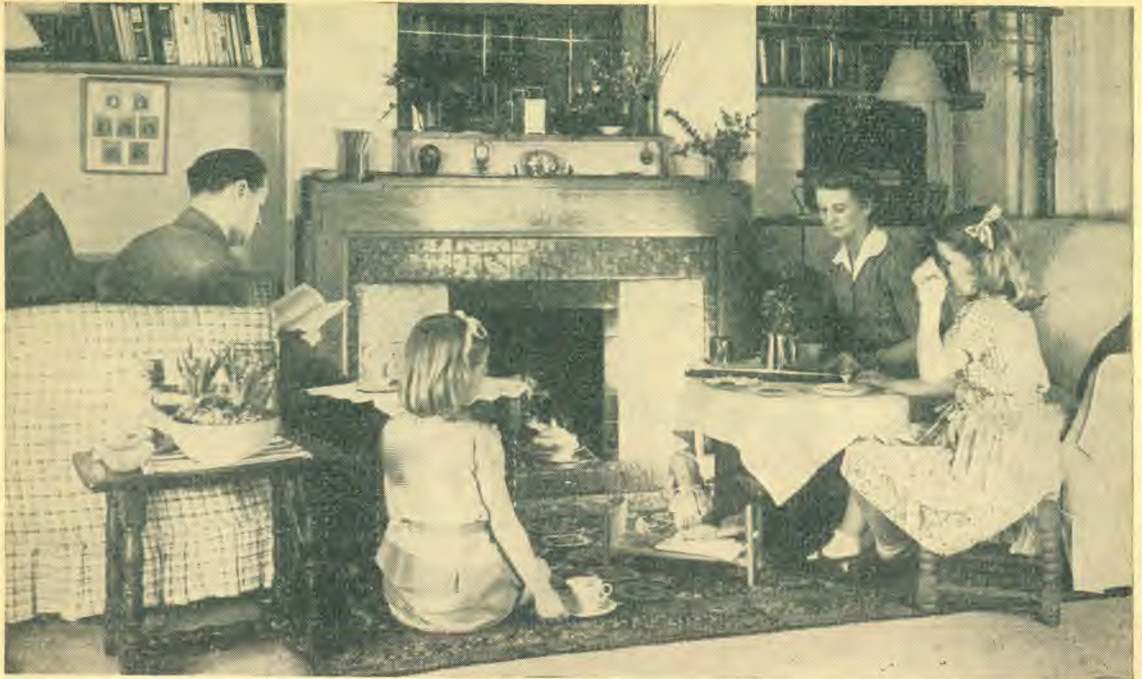
A happy home.