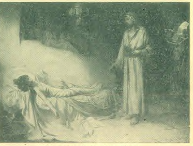
Jesus raises the daughter of Jairus.

Each instance in the Bible of a resurrection is a proof that all will one day rise from the death-sleep state. "Marvel not at this: for PAGE SIX