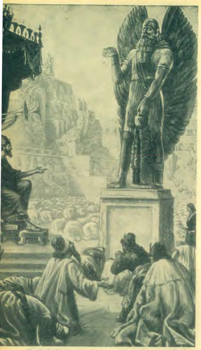
The young Hebrews refuse to bow down before the golden image which King Nebuchadnezzar set up.

In our last issue we considered the commandments of God in a preliminary way. We discovered that, far from being donc away with, as is so often claimed nowadays, these precepts are still vital to both God and man.