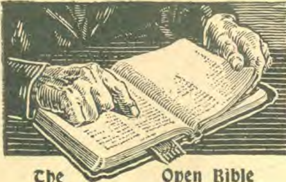
The Open Bible

(Next Time: "Tracing the Advance of Israel.")