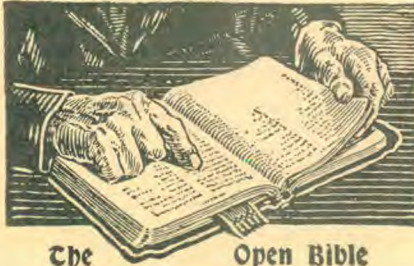
The Open Bible

ABOUT forty writers from different occupations wrote at intervals during 1,500 years; yet when their writings are brought together, one Author and a single theme are seen to prevail.