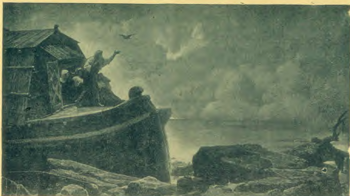
The end of the great Deluge.