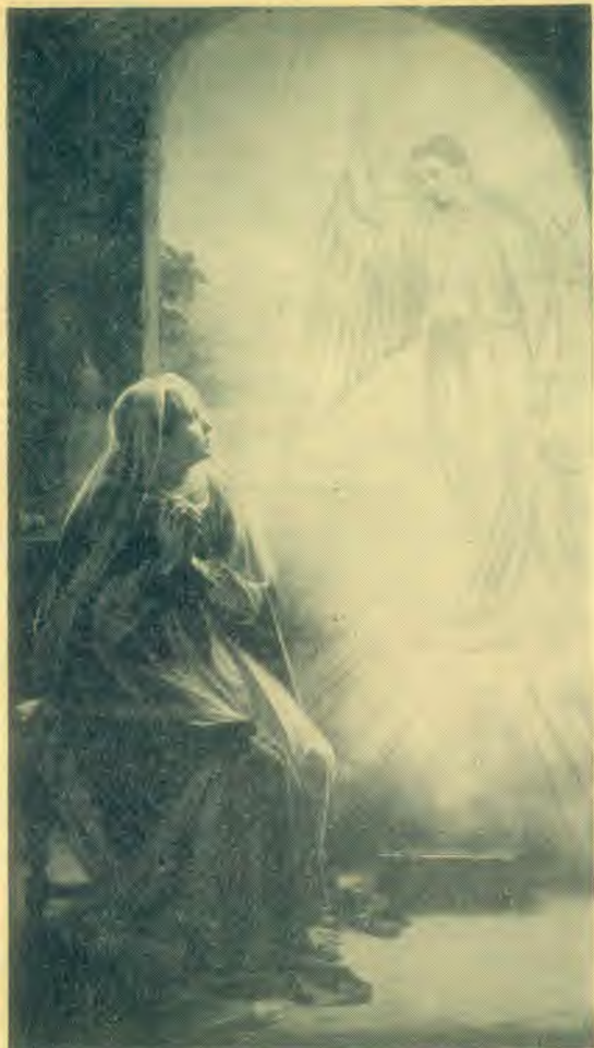
By Carl Bloch