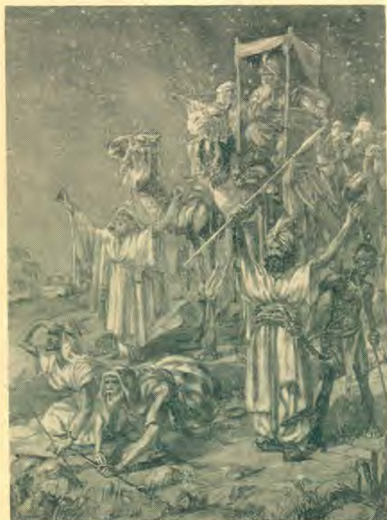
By J. Pander

They were "willingly ignorant." They closed (Continued on page 15.)