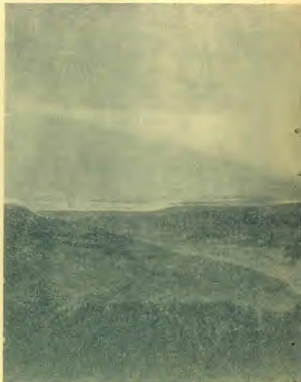
By Jean Francois Portaels

These days of peril were foreseen and foretold by the prophetic Word and are exactly described in Matthew twenty-four, and the other gospels. In Luke twenty-one we are told that just before the second advent of Christ there were to be "signs in the sun, and in the moon, and in the stars; and upon the earth distress of nations with perplexity; . . . men's hearts failing them for fear, and for looking after those things which are coming on the earth." Luke 21:25, 26. Matthew twenty-four