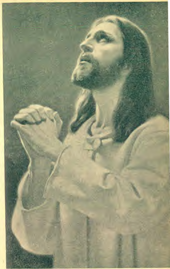
By L. Heupel

Perhaps that sufficiently pinpoints the problem to allow us to turn to the Bible for further enlightenment. The hustle of activity is considered by many to be the sum of religion and the seal of success. But as activity increases,