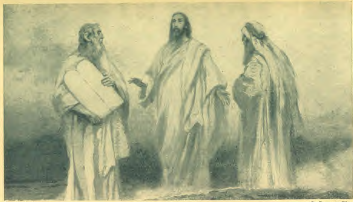
Moses the lawgiver of Israel, talks with Jesus and Elijah on the Mount of Transfiguration.