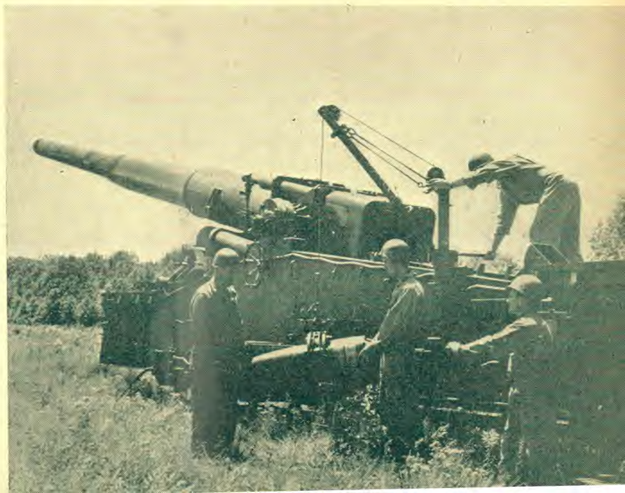
Loading America's first monster atomic cannon.