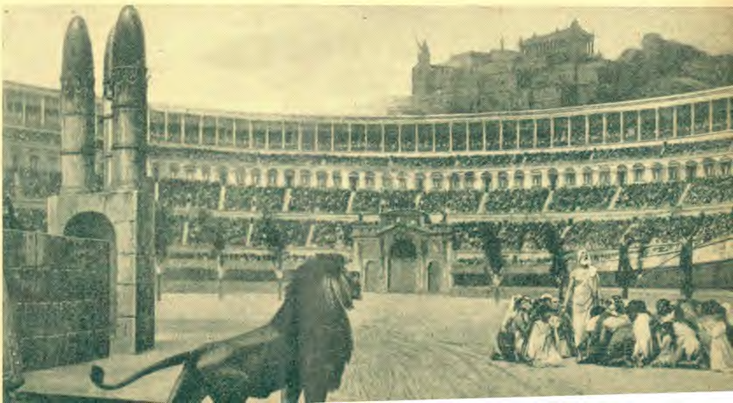
Christian martyrs in the Colosseum, Rome.