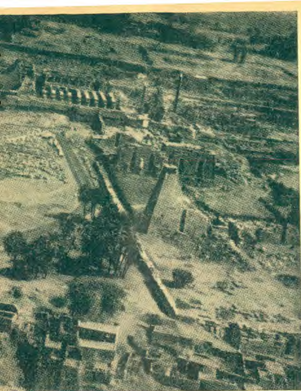
led a powerful witness to the trustworthiness of the Bible.