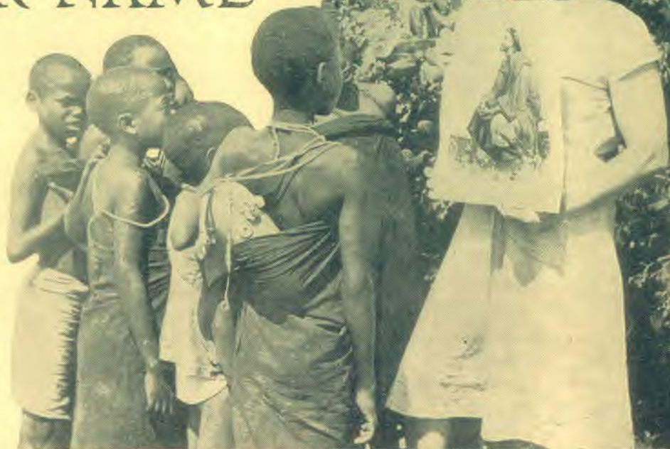
Native children in Africa listen to the story of Jesus.

It was only when Jesus came that mankind began really to learn the meaning of the essential father-