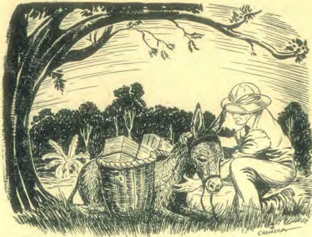
The donkey lay down, breathing heavily for a minute, and then closed his eyes.

Indeed, it was the bandits. The wicked men quickly surrounded the missionary and his