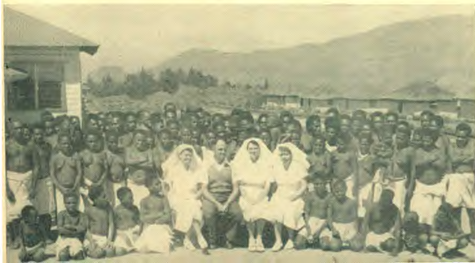
Staff and patients at the Mount Hagan Leper Colony, New Guinea.

Our mission staffs and operates for the Australian Government, a large leper station at Mt. Hagan in the highlands of inland New Guinea, 180 miles from the port of Lae. Eighty-five of the 400 patients were recently discharged, as the disease had been arrested. This station is at an elevation of 5,000 feet above sea level, where it is often cold for the almost naked natives. In response to appeals, we sent in two years 1,625 garments including woollen cardigans and many winter coats in splendid condition. These brought great joy to the recipients.