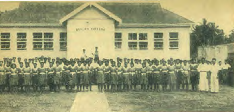
Beulah Training School, Tonga Islands.