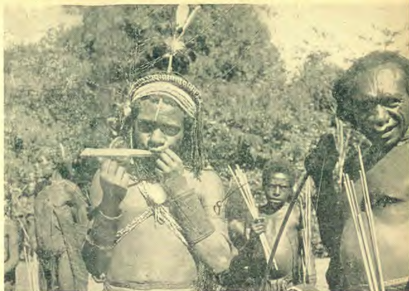
Natives of the interior of New Guinea.

During the second World War, our converted natives, and those of other missions, did a marvellous work for the allied forces operating against the Japanese invaders, acting as guides, carriers,