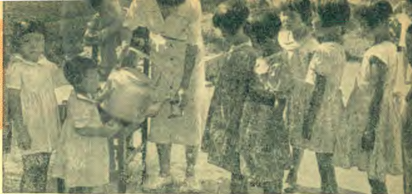
Victims of the Korean War find timely help at the Mission's orphanage, Seoul.

The medical mission launch "Luzeiro" on the Amazon.