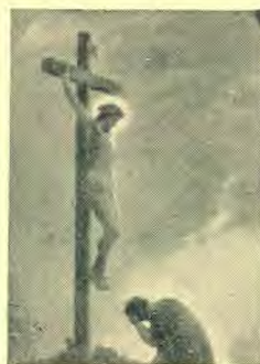
By Anton Dorph © Camera Clix

"Upon Christ as our substitute and surety was