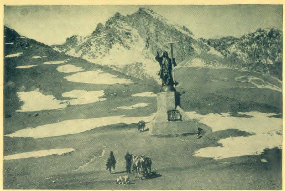
The famous statue of Christ in the high Andes of South America.