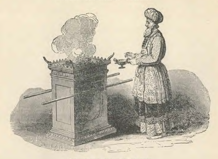
THE GOLDEN ALTAR OF INCENSE.