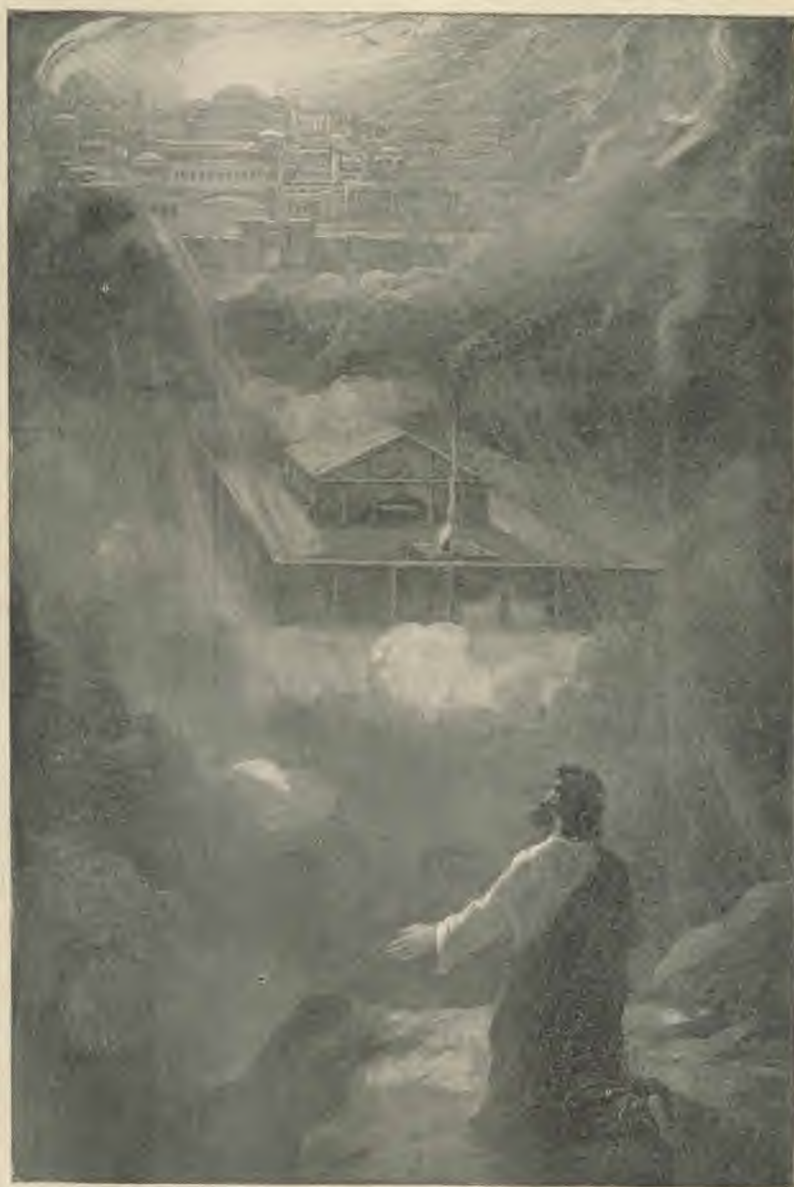
THE THREE TEMPLES

This illustration is taken from the new edition of the "Story of Daniel the Prophet."