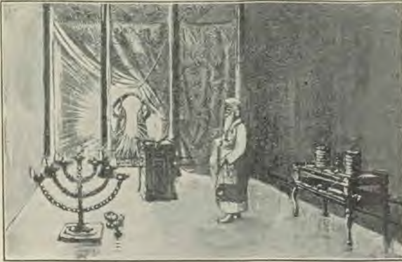
INTERIOR OF THE SANCTUARY