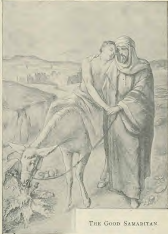
THE GOOD SAMARITAN.

"Thy neighbor?—it is he whom thou Hast power to aid and bless,— Whose aching heart or burning brow Thy soothing hand may press. Thy neighbor?—'tis the fainting poor Whose eye with want is dim, Whom hunger sends from door to door, Go thou and succor him. Thy neighbor?—'tis that weary man Whose years are at their brim, But low with sickness, cares, and pains— Go thou and comfort him. Thy neighbor?—'tis the heart bereft Of every earthly gem, Widow and orphan helpless left— Go thou and shelter them. Thy neighbor?—yonder toiling slave, Fettered in thought and limb, Whose hopes are all beyond the grave— Go thou and ransom him. Where'er thou meet'st a human form Less favored than thine own, Remember 'tis thy neighbor worn, Thy brother or thy son. Oh! pass not, pass not heedless by, Perhaps thou canst redeem The breaking heart from misery— Go share thy lot with him."