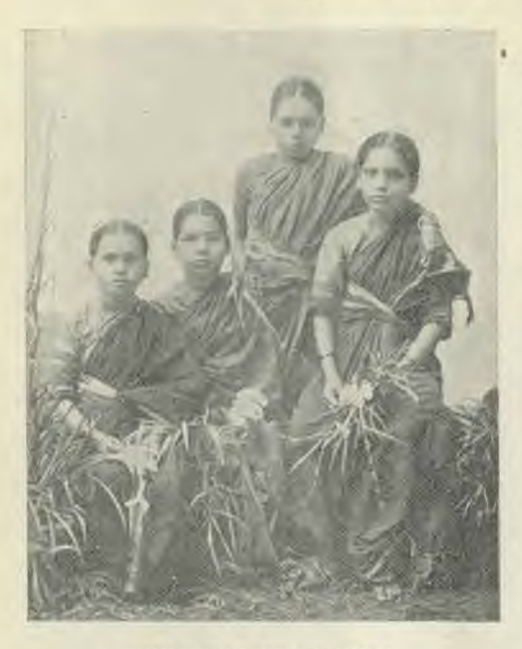
CHILD WIDOWS OF INDIA