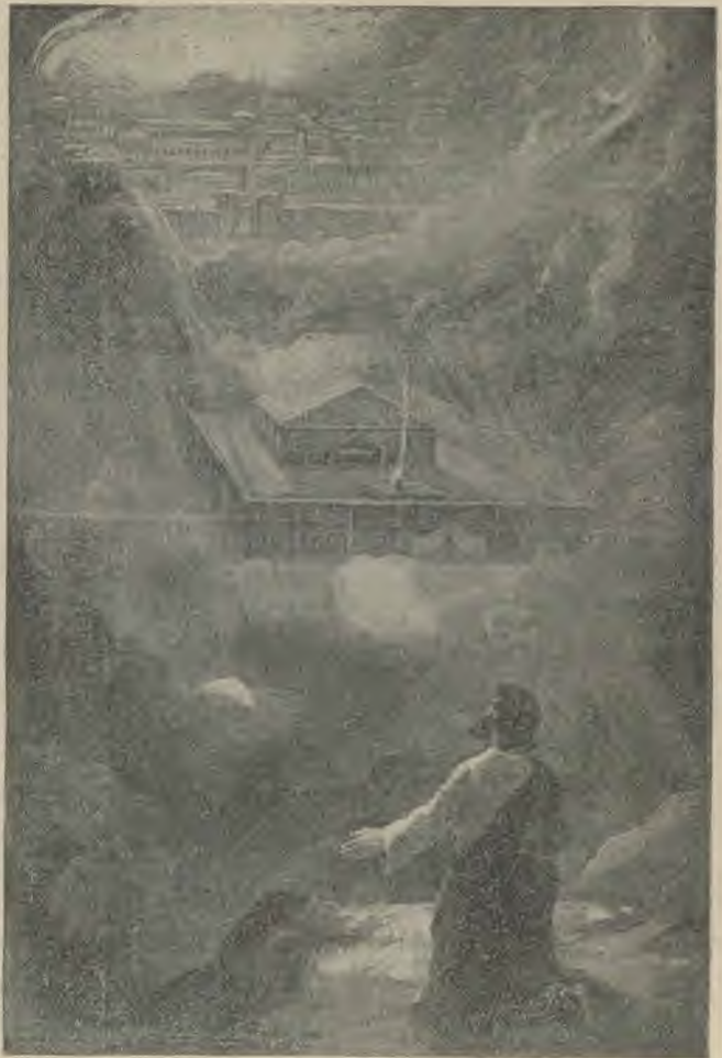
THE THREE TEMPLES

Henceforth the sinner need no longer wait for a priest to offer his sacrifice. The great Sacrifice had been made. Every child of Adam could accept His atoning blood. The way into the heavenly temple was now made manifest. The heavenly had taken the place of the earthly sanctuary. Hereafter man's faith was to enter within the veil, where Christ officiated.