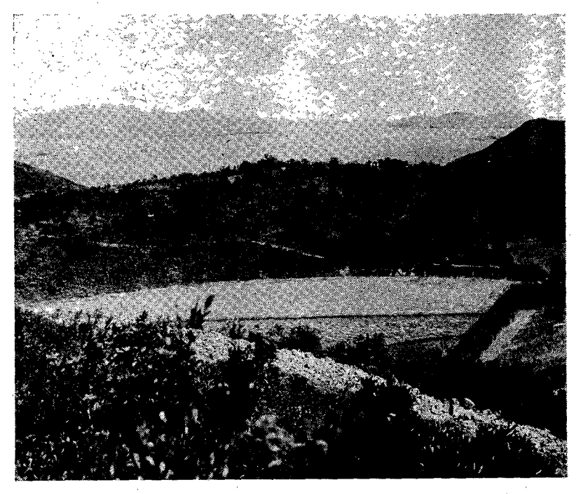
The Beautiful Site for the New South China Training Institute, One of the Projects to Benefit from the 1938 Ingathering Campaign.

This sort of program of average days, average calls, average returns calls for an "average" effort on the part of the "average" worker, and also for "average" plans on the part of the "average" mission committee. Let us work towards the goal of every worker, every mission, and every union reaching at least these minimum "average" goals during this 1938 Harvest Ingathering campaign.