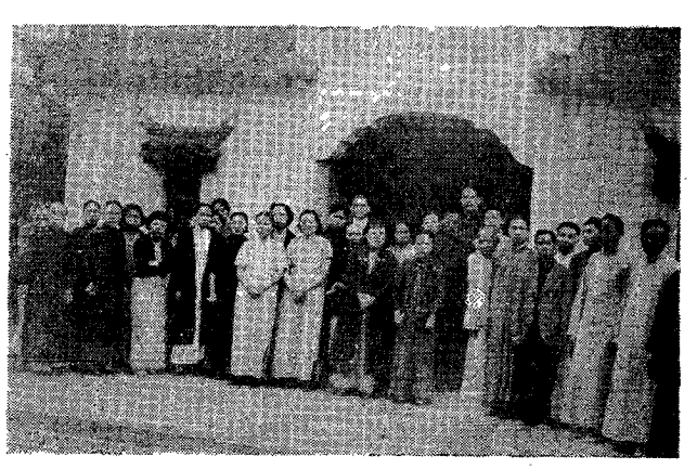
Group of candidates baptized in Shanghai.