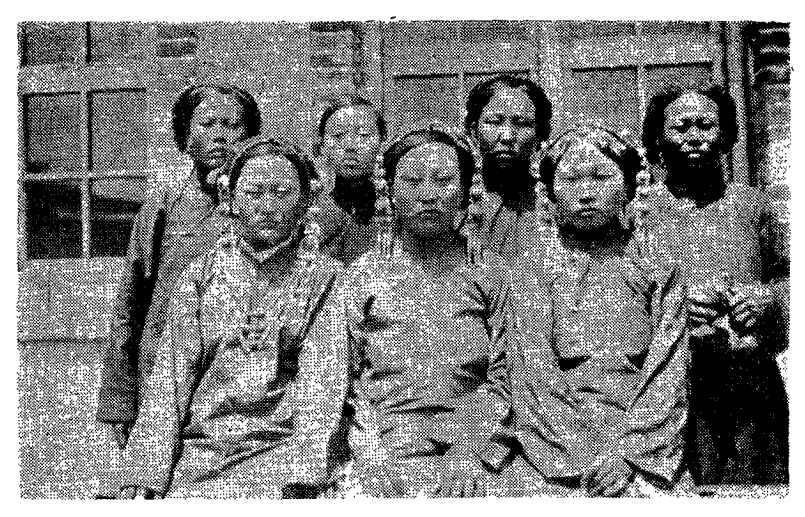
Young people from the Mongolian plains, at our station at Durban, Hodok.