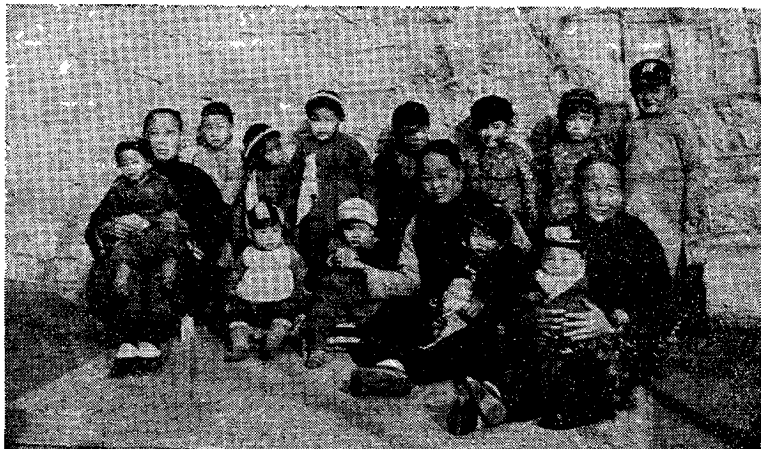
Children who accompanied their mothers to the training school, with their amahs

tain summit some two miles away, we paused to watch them disperse and begin winding their way back along the crooked footpath to the station.