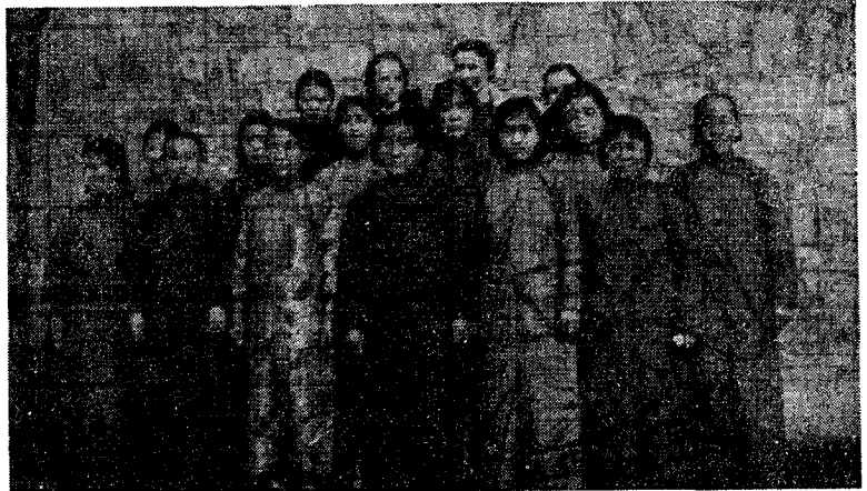
Students and teachers at the training class in Tsinan

After we had passed through their lines and had shouted our last goodbyes, they burst into singing, "God Be With You 'Till We Meet Again," making the entire country-side ring with this touching song. As we passed on and began ascending the slope of the mountain peak that lay between us and the great valley where the city of Kunming is located, song after song floated up to us on the wings of the wind. This was their method of saying goodbye and expressing their appreciation for the help they had received during our stay among them. Upon reaching the moun-