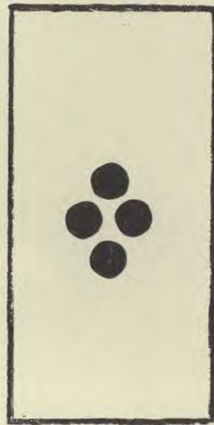
SUGGESTIVE BACK COVER