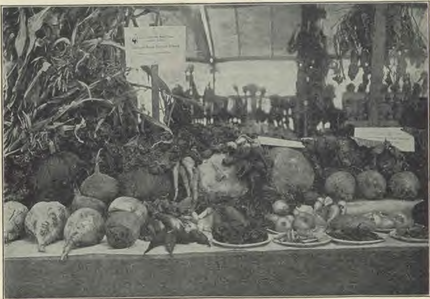
PRODUCTS FROM THE HOME GARDEN OF A SIXTH-GRADE BOY IN COLORADO