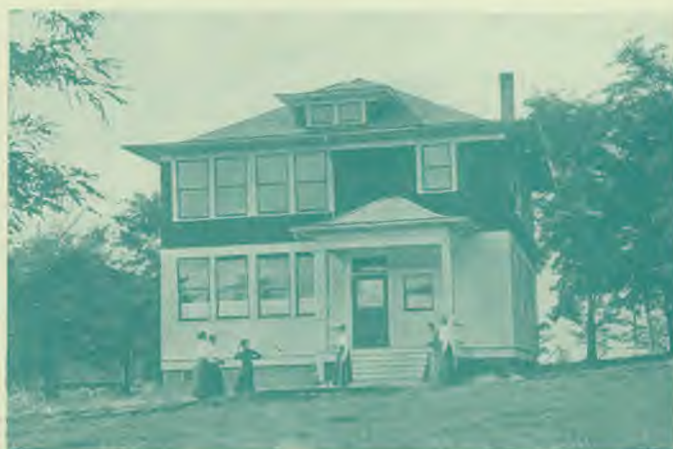
THE NORMAL BUILDING