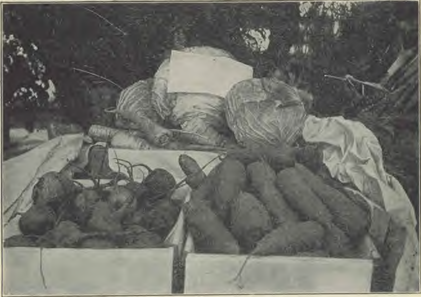
PRODUCTS FROM A 6 X 10-FOOT GARDEN GROWN BY A THIRD-GRADE BOY