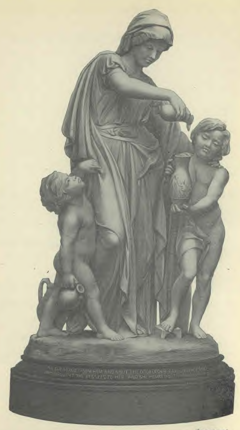
(See next page)