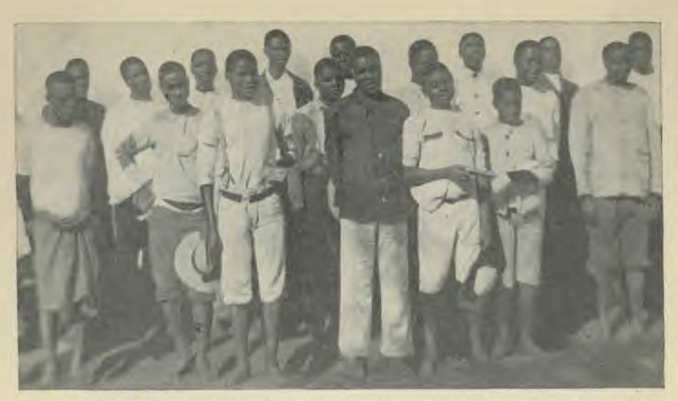
A GROUP OF NATIVE TEACHERS IN THE OUT-SCHOOLS, NYASALAND, ATTIRED FOR THEIR LONG JOURNEY HOMEWARD TO THE CENTRAL STATION AFTER TEN MONTHS OF SOLID SCHOOL WORK