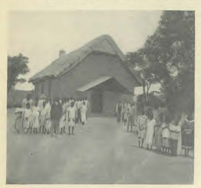
MORNING DIVISION MALAMULO SCHOOL, NYASALAND

put a sane and safe mold on new-formed nations, are the missions which were founded by men of the highest order of attainment, whose accurately trained powers were equally capable of "searching out the watershed of a continent, or the structure of the mandible of an ant." But it is the commonest observation of every missionary of experience that the work of the faddy, ill-prepared missionaries who trail through heathen lands, with nothing but fanatical zeal for a backing, lasts only as long as the fuel of their own shallow enthusiasm burns — a mercy!