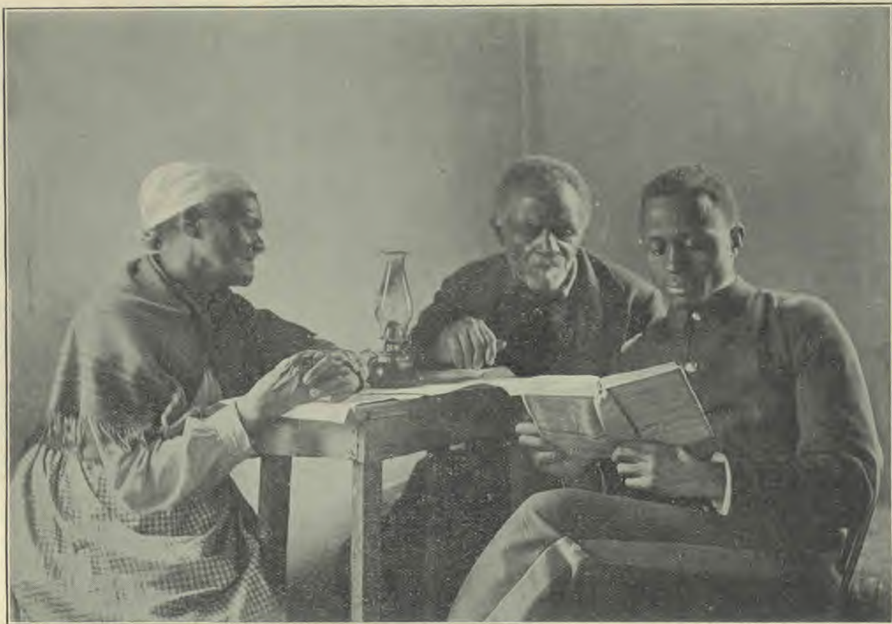
THE HAMPTON SPIRIT

Hampton students are active missionaries. They visit the cabins of the lowly, hold services of prayer and song in the town jail, poorhouse, and old soldiers' hospital, and teach in the neighborhood Sunday schools.