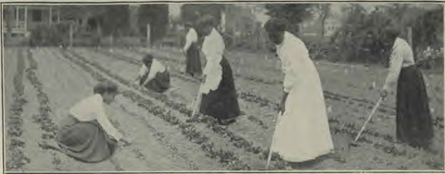
HAMPTON GIRLS ARE GROUNDED IN THE PRINCIPLES OF GOOD AGRICULTURE

noon, society meeting Sunday evening after supper. Neighborhood missionary work is done by dividing the town of Hampton into four districts in which teachers with student helpers hold weekly club meetings — for girls, for boys, and for women — to build up health and morality. On Sunday students hold religious services in the poor-house, jail, old people's home, six Sunday schools, and in the homes of the old and the infirm.