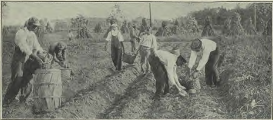
HAMPTON BOYS LEARN HOW TO GROW CORN, POTATOES, AND OTHER CROPS

sive premises. If a new building is to be erected, the trade students do the work under the direction of their supervisors without outside help, and without interfering with the regular shop routine. The last one thus completed was dedicated in 1913, and a new dormitory to cost $100,000 is now building in the same way. There are wagons to be built, clothing to be made, horses to be shod, 150 cows and 50 horses and mules to be cared for, with 600 acres of land to be kept under cultivation. About 30,000 pieces are put through the laundry each week, butter is made, and the girls do all the work in the dining service except that of the students' kitchen.