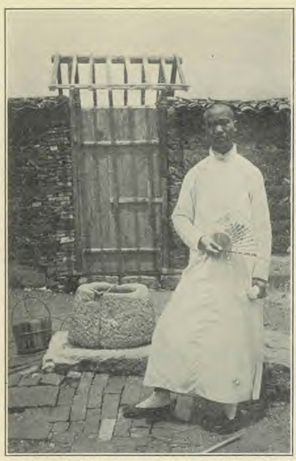
A SEVENTH-DAY ADVENTIST CHINESE COLPORTEUR

Standing beside a well at our mission station in Kashing. The well stone is very old, being a relic of the Taiping Rebellion of 1864.