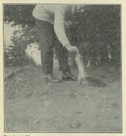
Student Movement ZACCHEUS

The shedding of winter's coat by the horses, cows, and dogs is one of the farmer's first signs