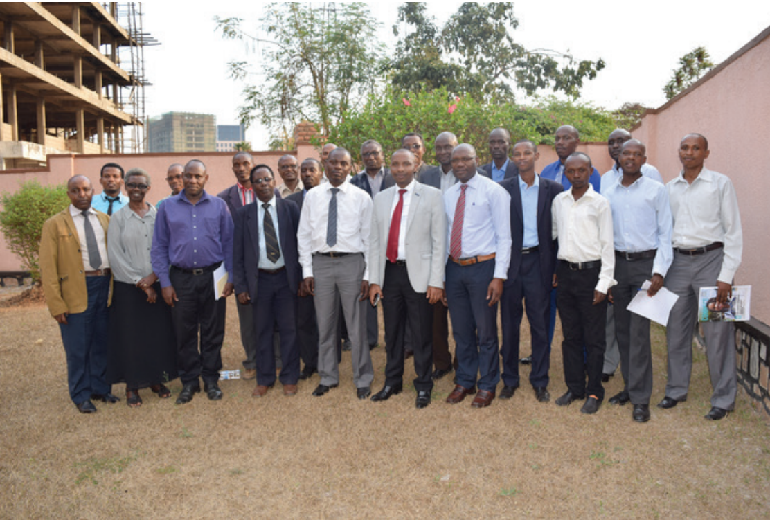
Participants at the Rwanda Union Mission Communication Advisory