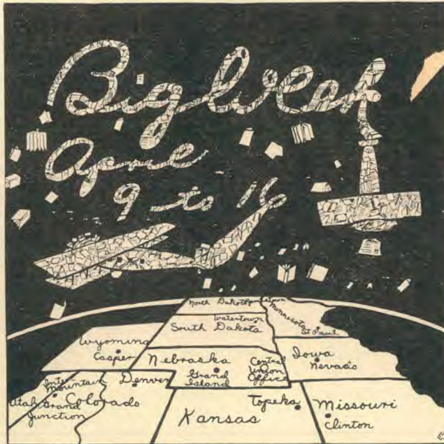
THE SPIRIT OF BIG WEEK IN THE CENTRAL UNION Write it in the sky and scatter literature like the leaves

the very facilities by which our workers out in the ends of the earth may give this message in the quickest and most effective manner. It builds and equips schools and small dispensaries. All these institutions are indispensable to our work if we expand and reach the millions who are still waiting. It is planned in 1932 to bring assistance to sixty-five enterprises. So, dear people, as these appeals are brought to your attention, we urge you to assist the Extension Fund in its noble work by, during the Big Week, calling