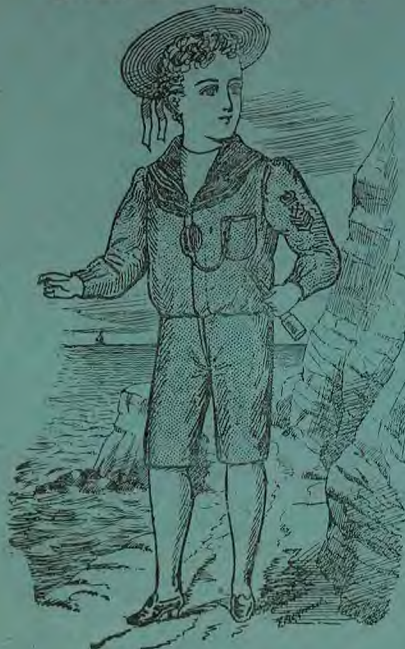
Suit 8/6 & 10/-.