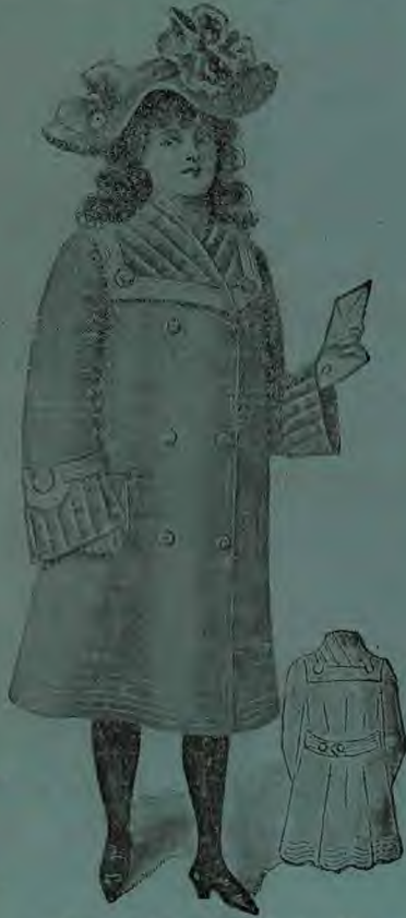
Brown Linen Costume 10/-.

Manufacturers Stock of London Tailor-made Skirts & Costumes, Girls' Dresses & Boys' Suits, over 500 Garments in all.