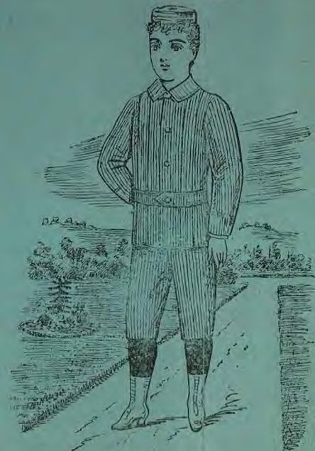
Suit from 6/-.