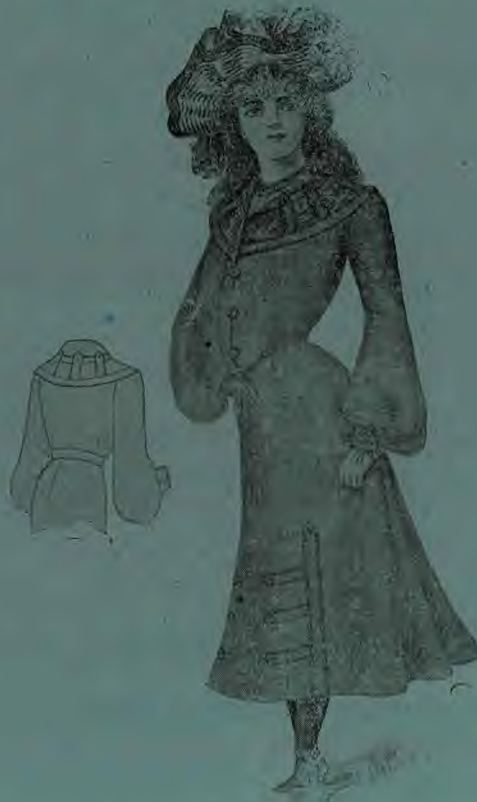
Colored Linen 12/6.