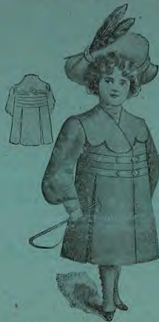
Colored Linen 10/-.