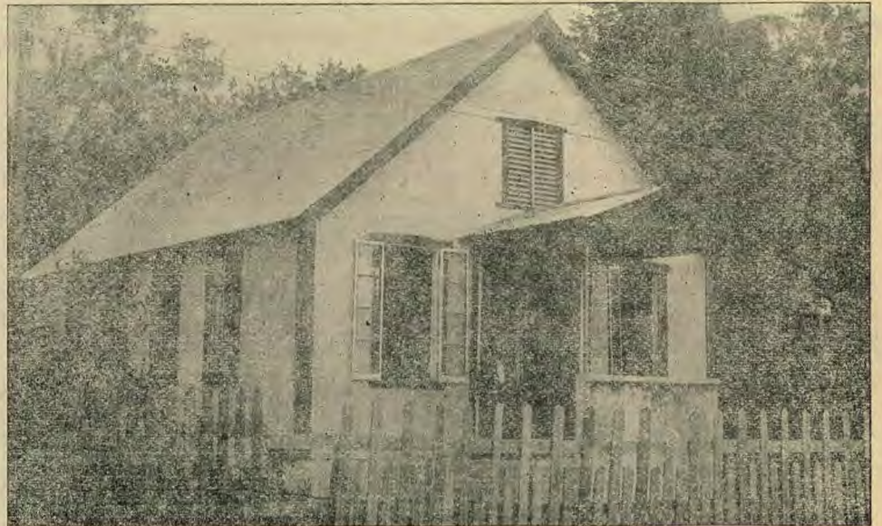
A Jamaica Country Church

Back he went into the mountains where he had worked before. He gathered the scattered, frightened Christians, and inspired them with new courage and hope. He protected the widows; and fed the orphans. He gave himself without fear or fatigue to a work that