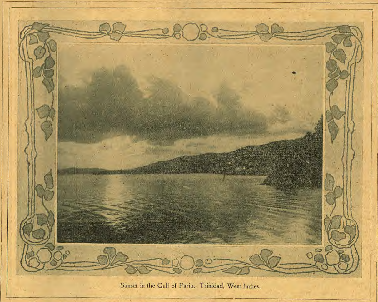
Sunset in the Gulf of Paria, Trinidad, West Indies.

"O'er glistening sea the evening sun is streaming, The distant hills are with its glory crowned."