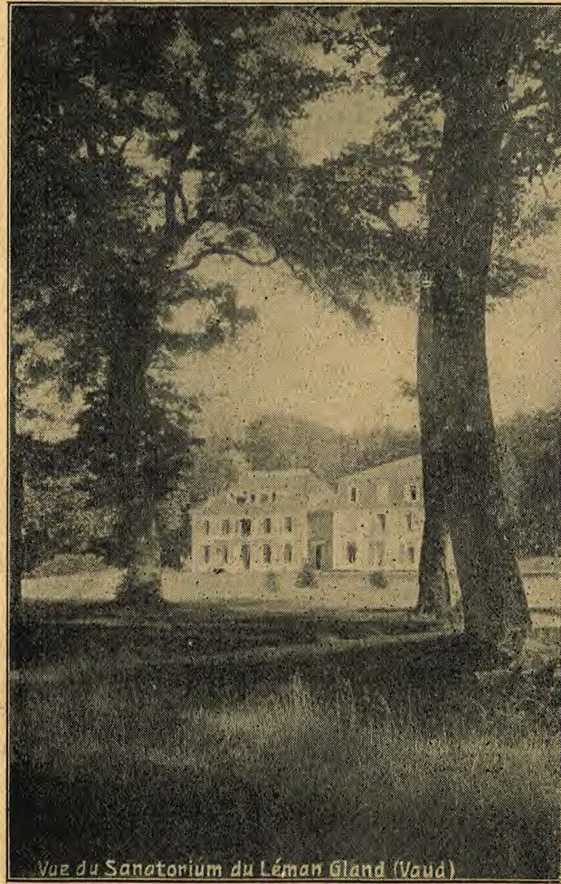
SANITARIUM, GLAND, SWITZERLAND.