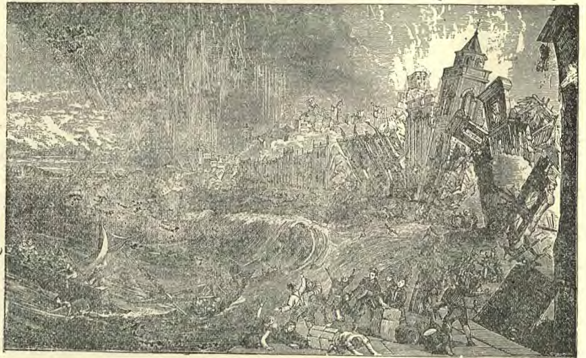
Earthquake, Lisbon, 1755--Opening of Sixth Seal.

"And when he had opened the fifth seal, I saw under the altar the souls of them that were slain for the Word of God—and white robes were given unto every one of them." During the reign of Anti-christ, millions of people were put to death in the most cruel manner possible as the worst of criminals and lunatics. The light of the Reformation dispelled the darkness of bigotry and intolerance and proved that Huss, Jerome, Latimer and many others were not the base characters they were accused of being, but were true, loyal men, willing to suffer death rather than do wrong. Their blood with that of righteous Abel cries to God for vengeance, and when the days of trial for all of God's people are finished they shall come forth in the first resurrection clothed with robes of