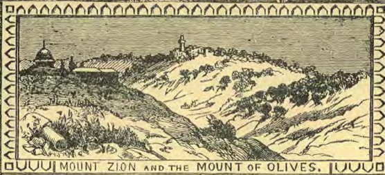
MOUNT ZION AND THE MOUNT OF OLIVES.

They that TRUST IN THE LORD SHALL BE AS MOUNT ZION, which cannot be removed, BUT ABIDETH FOR EVER.