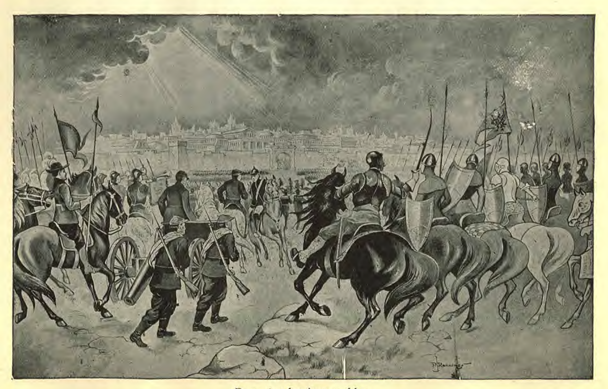
Preparing for Armageddon

One of the bills now before the United States Congress proposes that that body authorize the building of two world-recordbreaking 27,000-ton battleships, each to cost approximately $18,000,000. One peace society which opposes the passing of the measure has prepared figures showing ways in which this great sum of money might be better spent in actually benefitting the people. The cost of one of these battleships, they say among other things, would establish fifty training schools, teaching the rudiments of a trade to 75,000 persons a year. But we do not look for any government to turn from the building and equipping of battleships for the purpose of using the money thus saved in establishing schools.