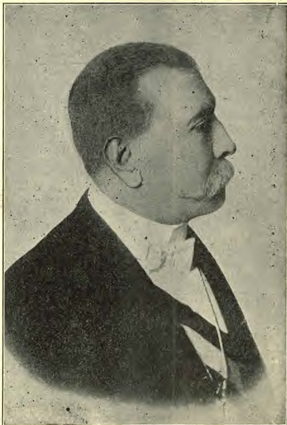
President Diaz of Mexico

There is a new grave now on the banks of Mother Ganges. We are left to mourn, and in our sadness we feel that no other has ever borne so heavy a sorrow. Yet how many sighs and sobs have those calm, quiet waters heard! We have hope; yet they have gone down without hope or God in the world. Their loved ones have been left with a philosophy which teaches no meeting beyond the grave.