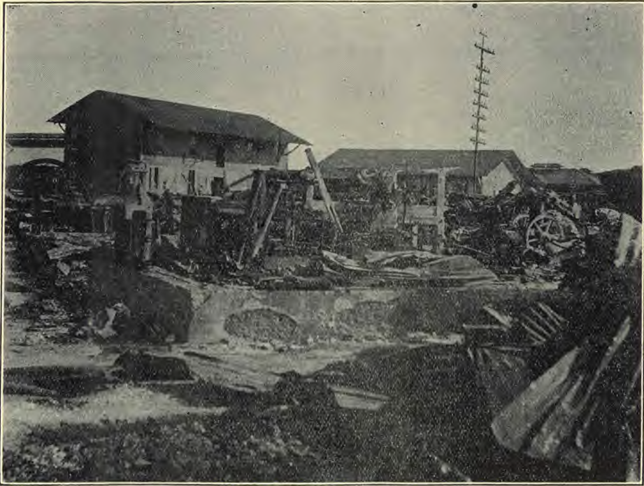
Watchman Office the Morning After the Fire

Immediately on the return of the writer to Panama preparations began for the removal of our families and what remained of our equipment to Jamaica. It was with