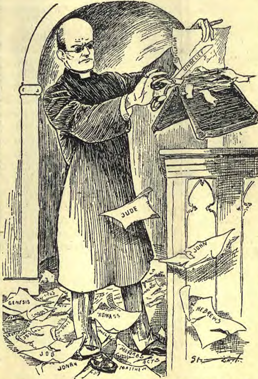
THE SPIRIT OF HIGHER CRITICISM And what remains of the Bible, Beloved, is divinely inspired

for light, God the Creator. The devil will say to his apostles: "Let the dying soul believe in the god of evolution, the god of pantheism, the god of a thousand philosophies. Teach them of the great Marduk, of a hundred Baals, of Jupiter, and his father Saturn, of Bacchus, of Venus, of Mars, of Apollo, of Plutus, of Mammon, of the whole world's pantheon. Teach them there is no sin. Say to them, 'Ye shall not die; ye shall be as God.' But by every device, every hypothesis, every theory of science, philosophy, and theology, hide from them God, the Creator."