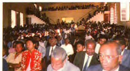
Training seminar for elders in Madagascar