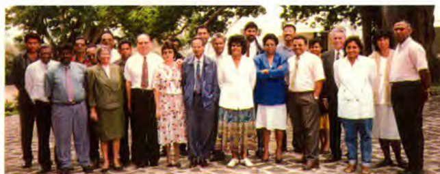
Pastors and elders in Mauritius