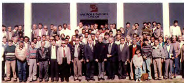
Training seminar for elders in South Brazil