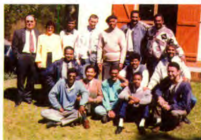
A group of pastors and elders in Reunion, Indian Ocean