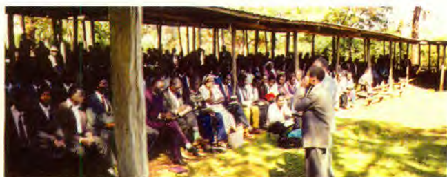
More than one thousand elders attended a training seminar in Kenya, East Africa