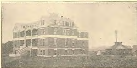
THE KANSAS SANITARIUM