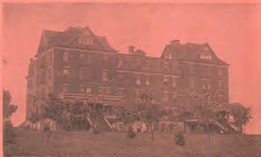
NEBRASKA SANITARIUM, COLLEGE VIEW, NEBRASKA

Vol. 1 COLLEGE VIEW, NEB., DECEMBER 04, 1905 No. 23