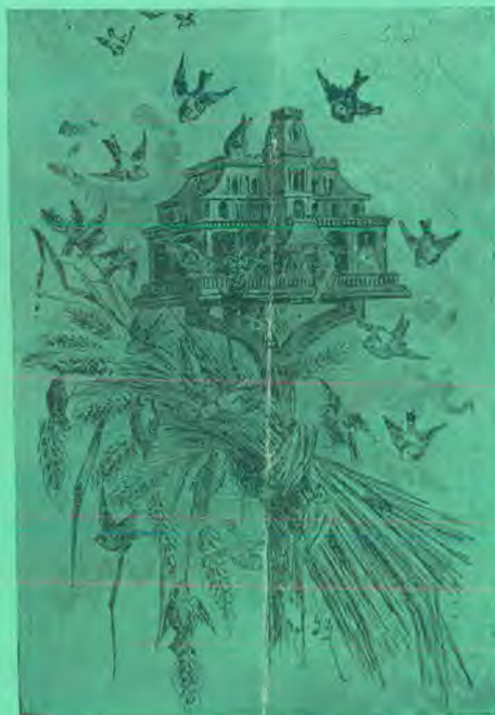
After the Harvest