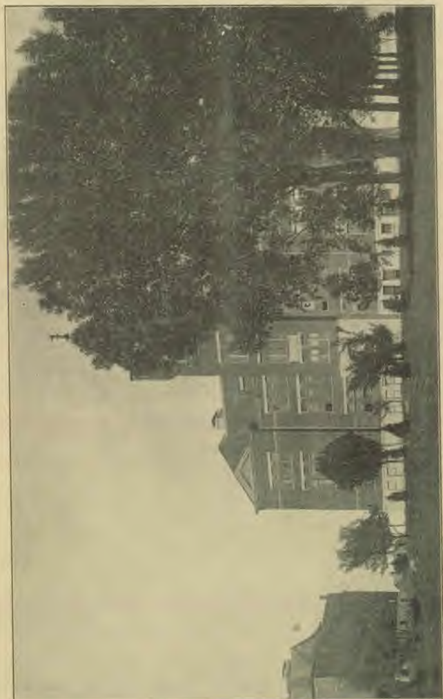
The place where hundreds of young people are expecting to be September 18