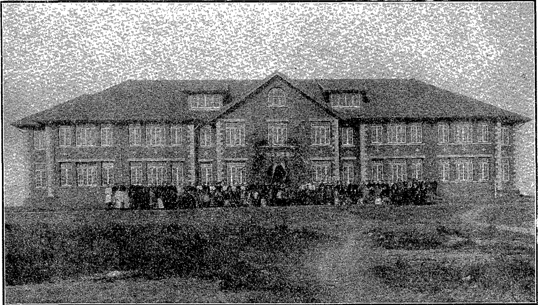
Main Building, China Missionary Junior College Chiao Tou Djen, Kiangsu, China