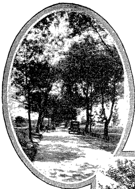
Above: Approach to new Shanghai Sanitarium and Hospital, along Rubicon Road.

amount of knowledge the ordinary man must have in the modern world in order to live, requires that he be able to get it through the printed page, rather than by oral tradition as he used to do. There is at present a mass educational movement. It is one of the most significant social movements in the world to day. It has as its aim, nothing short of producing by the use of the Thousand Character Readers, a literate China in one generation. The story of the advance and development of this movement reads like a romance. It has now close to a million students. The policy of this movement is not only to teach the thousand characters and elements of reading, but to develop citizenship training as well.