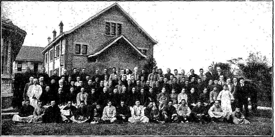
Central China Union workers gathered at the general meeting held in Hankow November 10-20