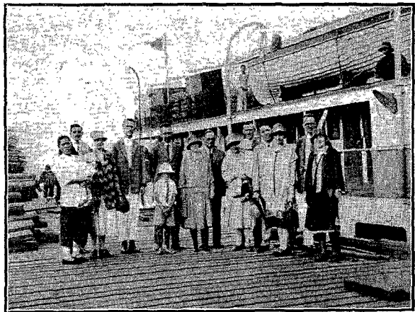
Party of workers of the Nanning (Kwangsi) mission about to start back to their station. Present conditions forbid the return of the wives and children.