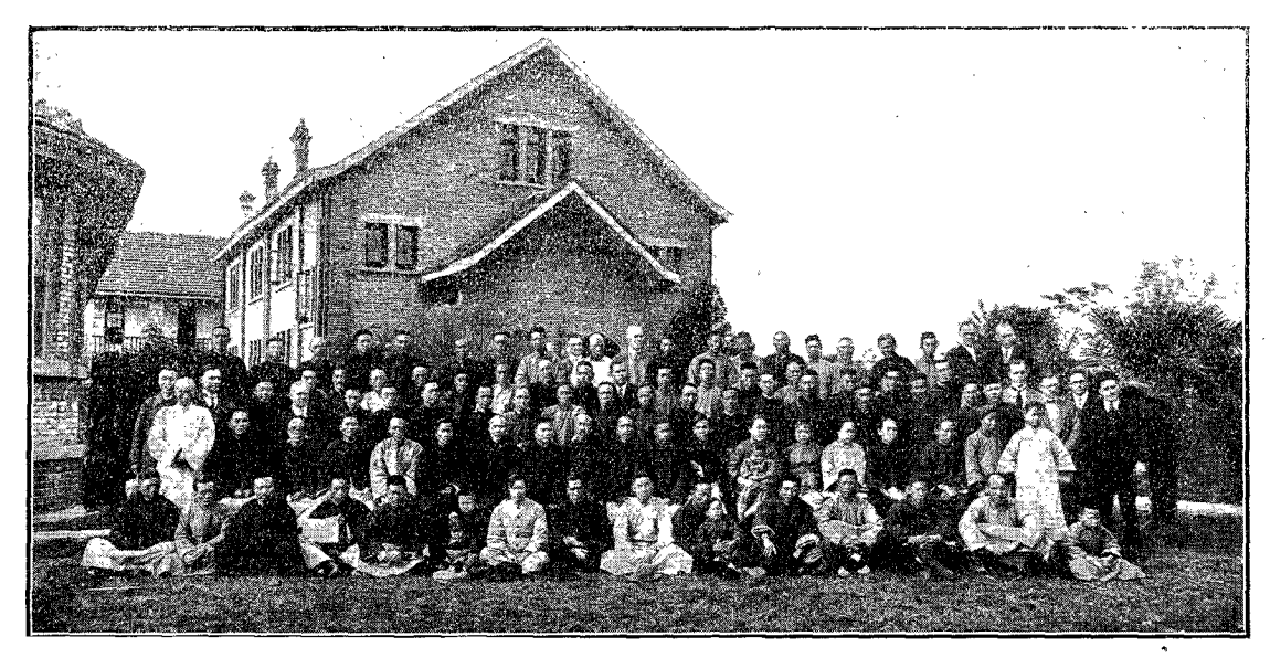
Central China Union workers gathered at the general meeting held in Hankow November 10-20