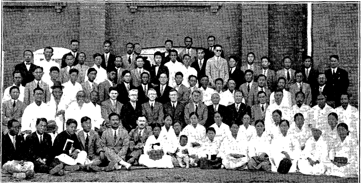
Delegates in attendance at the West Chosen Mission Biennial Meeting, Soonan, Korea

Following the meeting plans were laid to open up work in one new center of this large unworked territory. Our people and our workers are of good courage and the prospects are bright for a steady advance along all fronts.