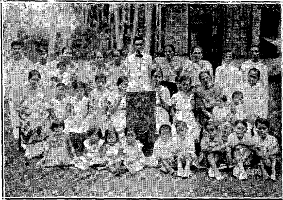
The Lutucan Sabbath School

The next quarter I was privileged to present them with the coveted "AA" banner. The reason why they were entitled to a "AA" banner was that they were not satisfied to remain where they were. Their ambition was to reach the top and that