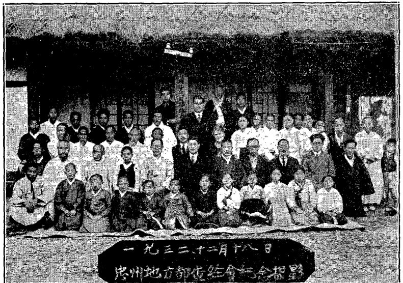
Delegates from eight Sabbath Schools who met at Choong Choo for a Bible Institute

In order to increase the Sabbath school membership there must be very (Continued on page 7)