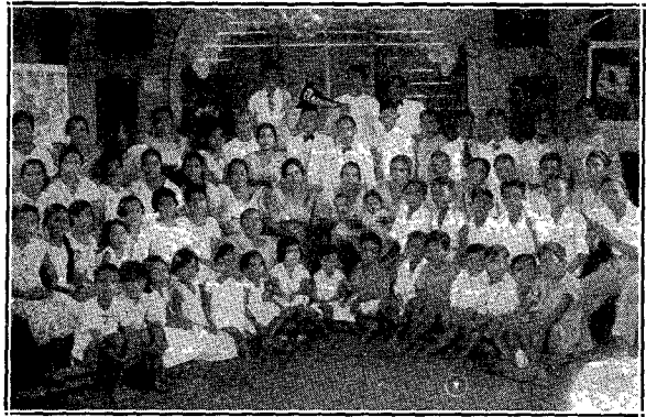
The Guinayangan Sabbath School

The picture accompanying this article shows a school in the South-Central Luzon Mission which is a good illustration of the point before us. During the last six months this school brought to the Master not less than sixteen souls, most of whom have already been baptized. The superintendent is himself an ardent soul-winner who strives to make his school a continual harvest field for Christ. Children are invited to bring their playmates and brethren are urged to bring their neighbors. Naturally, the